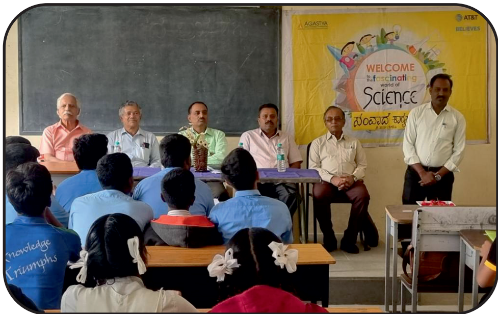
Interaction program arranged by Agastya International foundation in association with KPA during November 2023 at Nelamangala for 10th std. students