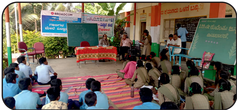
Interaction program at Huliurdurga, for 10th std. students on 29th December 2023